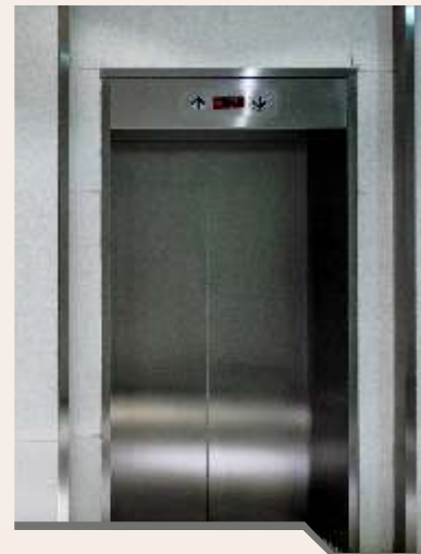
Standard Quality Passenger Elevator