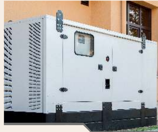
24X7 Power Back-Up