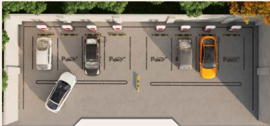
Basement And Ground Level Allotted Parking for residence