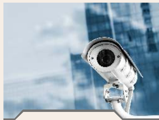
CCTV Camera For Security Of The Premises