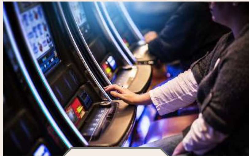
Games / Arcade room