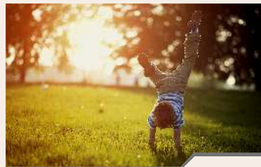
Lush Green Garden